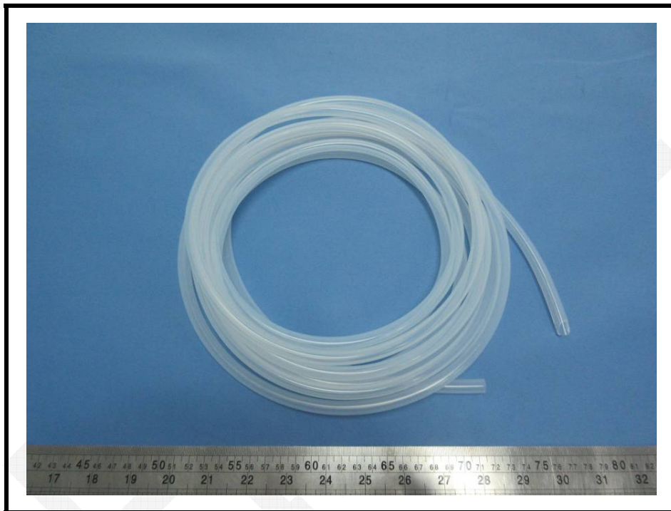
Photograph of Sample 样品照片

BACL authenticate the photo on original report only